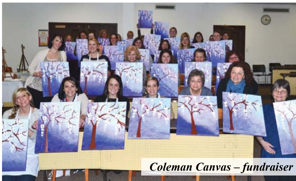
Coleman Canvas – fundraiser

Give Your Grandchild The Gift Of A Coleman Education